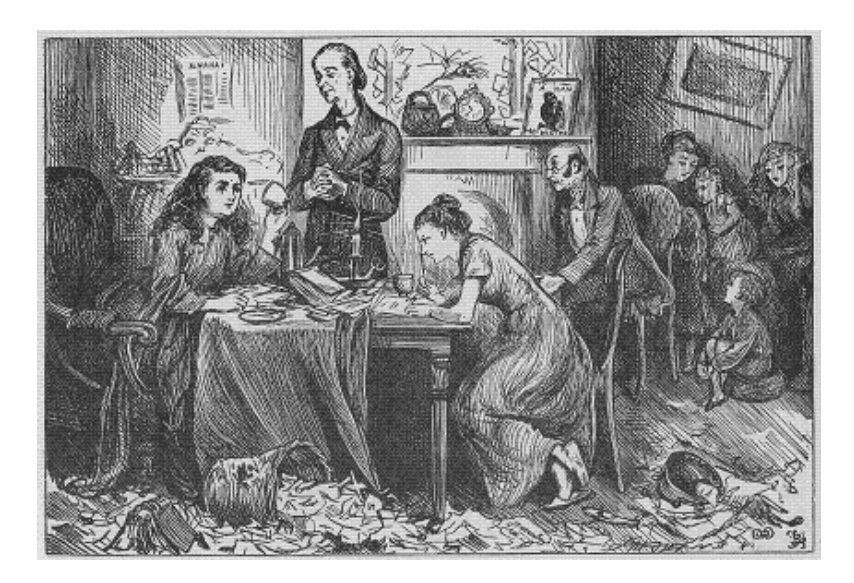
Figure 4: "We hope by this time next year to have from a hundred and fifty to two hundred healthy families cultivating coffee and educating the natives of Borrioboola-Gha, on the left bank of the Niger." Illustrated by Fred Barnard (Household Edition, BH , ch. 4).

The sense of charity with which Dickens is often identified does appear to have gradually waned through his later works, where his discourse is imbued with elements of anti-feminism and