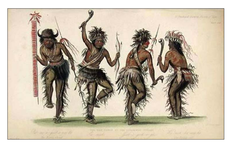
Figure 2: "The War Dance by Ojibbeway Indians" (1855) by George Catlin.

civilised audience, in all good faith, complied and admired. (HW, 11 June 1853)